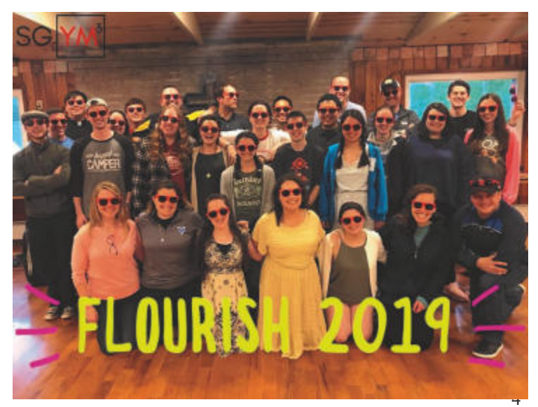
Young Adults from St. Greg's attended retreat last weekend. "Flourish". The group went to Camp Pioneer in Angola NY. The retreat was a huge success!