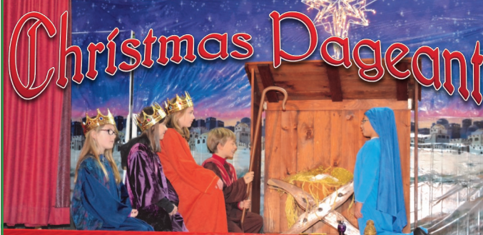
"The Greatest Gift"

Of His Fullness we have all had a share ... love following upon love. John 1:14,16