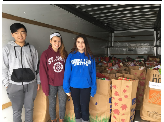
High School Students at Christmas Gift Gathering