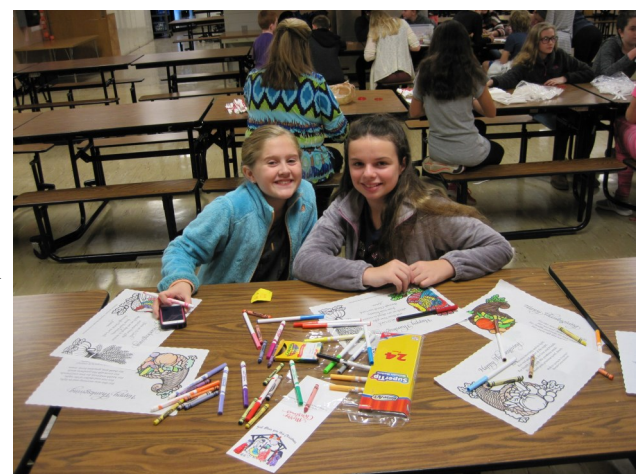
Disciple Camp Students coloring placemats for nursing homes