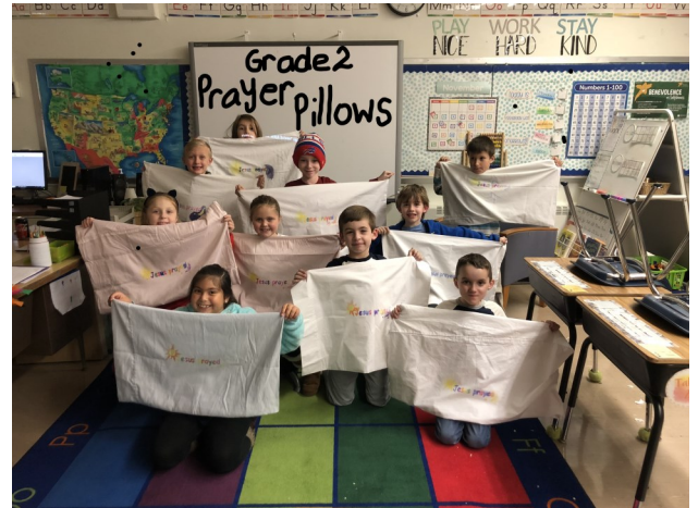
Grade 2 Prayer Pillows

“Not all of us can do great things. But we can do small things with great love.” (Mother Theresa)