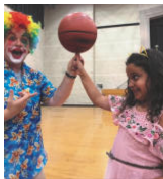
The Circus-themed Disability Picnic was enjoyed by all at the Ministry Center on July 21!