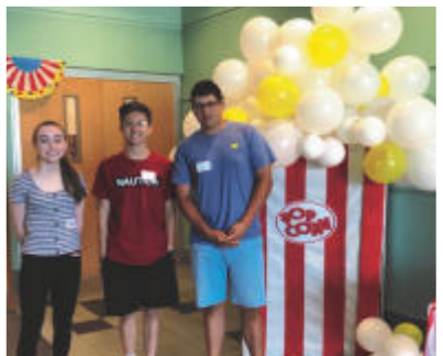
Special thanks to all of the volunteers who helped make the Disability Picnic such a wonderful event! (Pictured on the left: Some of the student volunteers who helped with decorations)