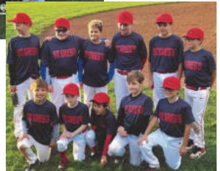
JV Team Grade 4 - 6