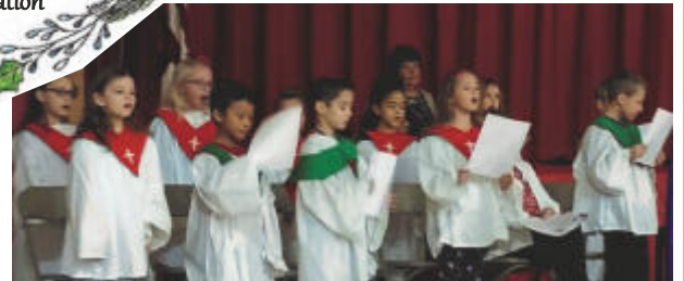
The Greatest Gift: Scenes from the Christmas Pageant held on Dec. 14 in the School Gym.