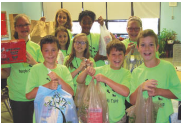
Disciple Camp Students collected non perishables for the St. Vincent de Paul Pantry last year!