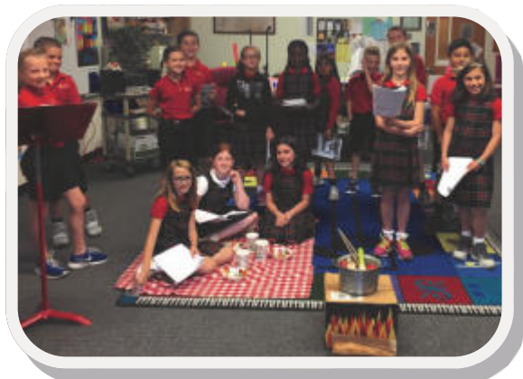
Homeroom 401 rehearsing for their upcoming performance of Stone Soup.

Contact the school office to register and discover the St. Greg's difference today!