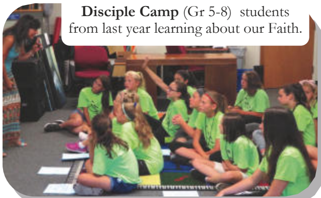
Disciple Camp (Gr 5-8) students from last year learning about our Faith.

Become a Catechist and Make a Difference