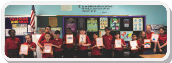
Grade 5 has been learning about the Constitution in Social Studies. Students designed and illustrated the words of the Preamble.