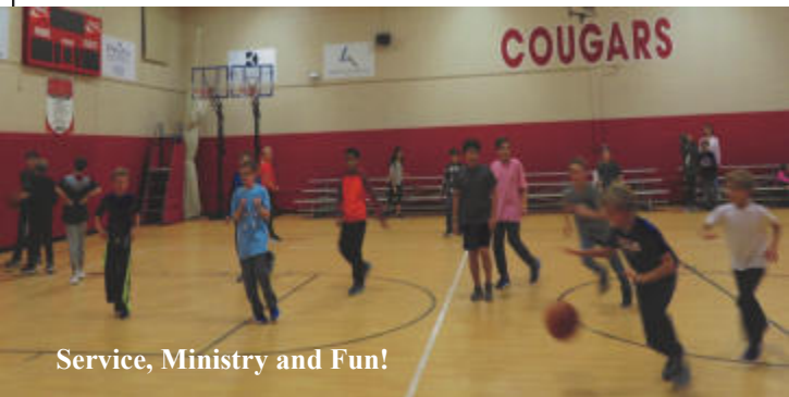
Service, Ministry and Fun!