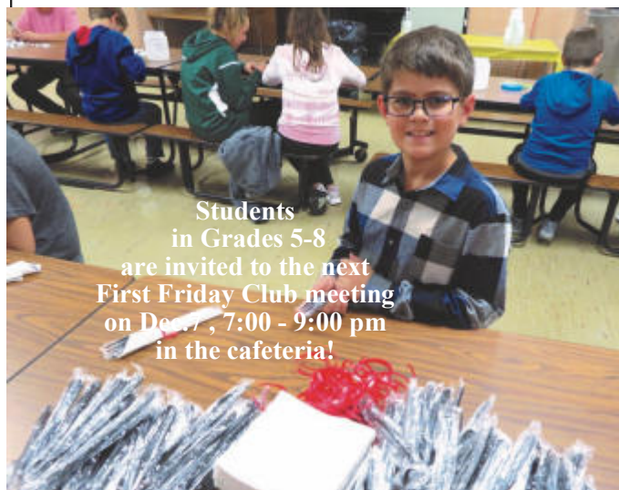
Students in Grades 5-8 are invited to the next First Friday Club meeting on Dec 7 , 7:00 - 9:00 pm in the cafeteria!