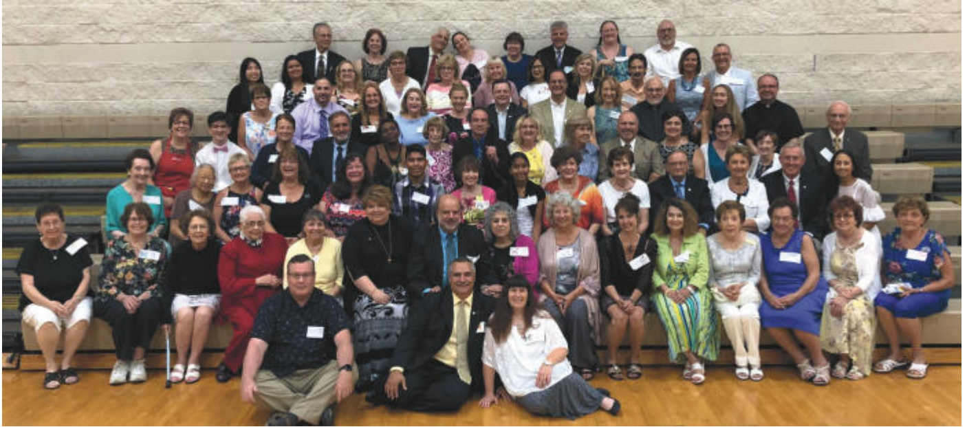
Participants in July's Mission 37

Mission is a faith-filled opportunity that engages present and past participants with speakers, liturgies and fellowship. The speakers are passionate in the way they share stories and information, that can encourage participants to reflect on their faith. The liturgies are heart-opening, mind-opening and help build a deeper relationship and understanding to our faith. Mission creates a sense of fellowship and community that inspires you to become more involved in the ministries of our Parish. Mission isn't about just "making mission", but being part of a team that can open your heart and mind to the possibilities to make dynamic changes in your faith and community.