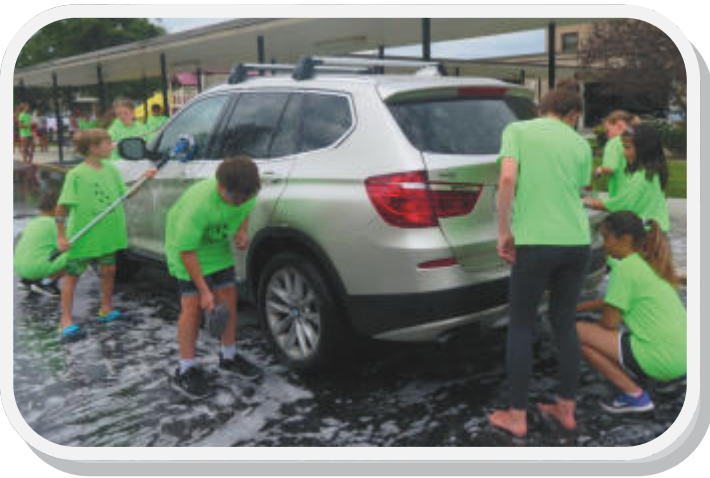
Disciple campers wash cars to benefit a missionary family.