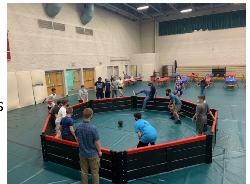
"Gagaball", a variant of dodgeball is a big hit