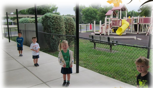
Early Kindergarten students learn to stay physically distant from each other.

"This will be a unique year for us all as we wear face coverings and physical-distance within the school. Yet, the blessing of being together five days a week has given the faculty and staff great joy. The sound of children in the halls of St. Gregory the Great School after nearly six months has brought much hope and positivity!"