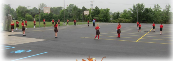
Seventh Graders keeping their distance at recess.