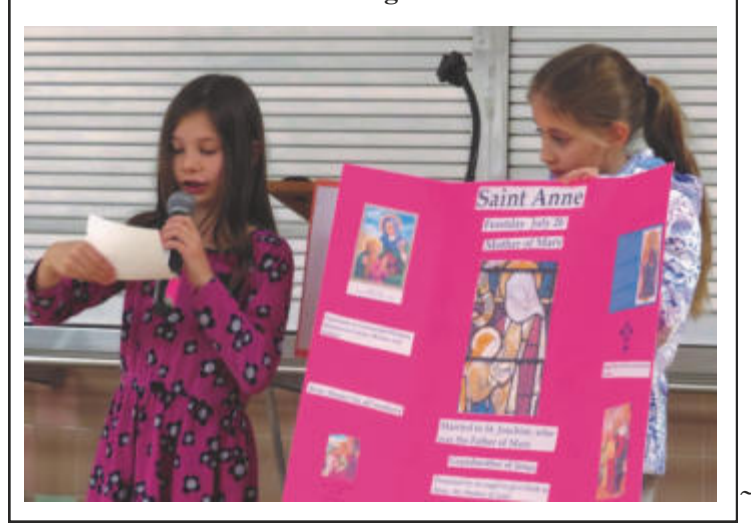
FFF Fourth Graders gave presentations about their favorite saint during the Saints Fair.