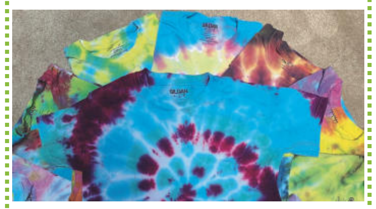
For their Outreach project, High School Summer Program students made tie dye tee shirts for Our Lady of Black Rock's Vacation Bible School kids.