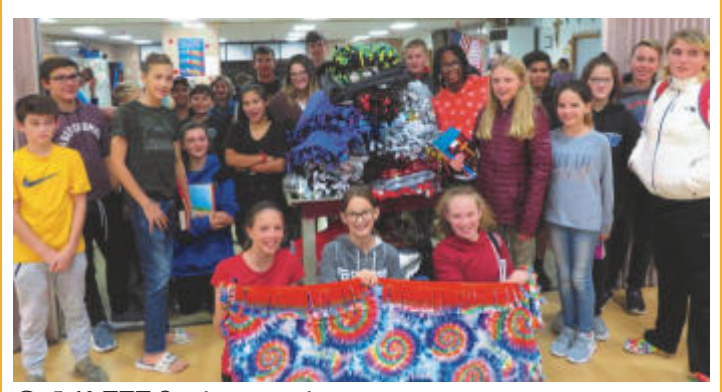
Gr 5-10 FFF Students made blankets for Gerard Place, which provides housing, supportive services, community education and outreach to homeless mothers and their children to help them toward self-sufficiency.

The Next Rosary Club is on November 18. Rosary Club (Grades 5-8) meets on Mondays from 6:15to 7:15 pm in the School Cafeteria, except when there are no classes due to holidays. Hours attended counts towards ministry hours as Rosaries made are given to new parishioners, distributed on Ash Wednesday, etc. There are NO CLASSES from November 28 – 30. A Blessed Thanksgiving to you and yours!