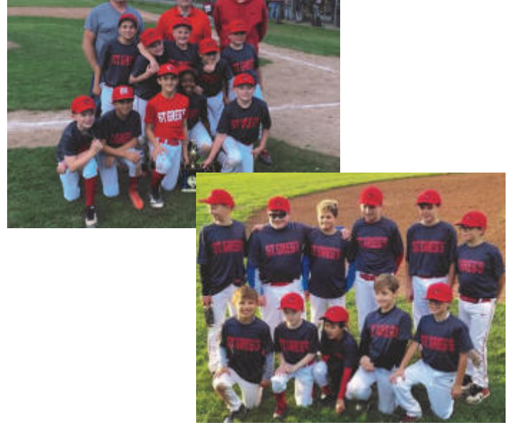
JV Team Grade 4 - 6