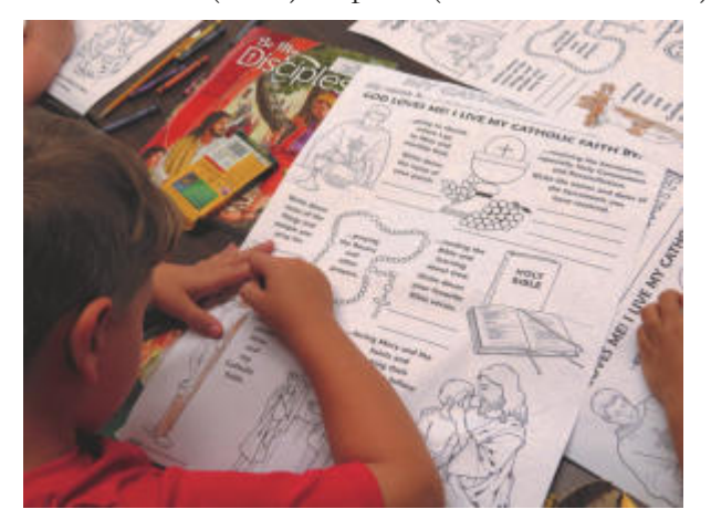
Family Faith Formation classes begin this week! www.stgregs.org/register-now/

Little Cherubs (PreK): Sept.14 (9:00 am - 10:30 am)