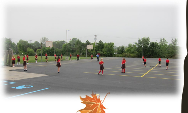
Seventh Graders keeping their distance at recess.