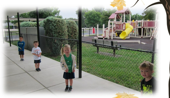
Early Kindergarten students learn to stay physically distant from each other.

"This will be a unique year for us all as we wear face coverings and physical-distance within the school. Yet, the blessing of being together five days a week has given the faculty and staff great joy. The sound of children in the halls of St. Gregory the Great School after nearly six months has brought much hope and positivity!"